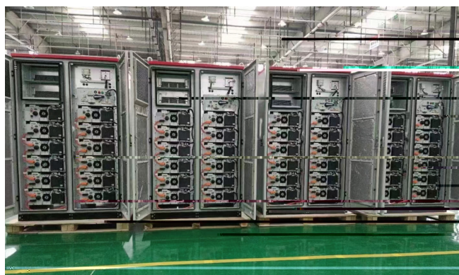
Figure 1: Project Photos

Located in 5 industrial parks, the 25 sets of JinkoSolar's SunGiga liquid cooling storage system (ESS) coupled with renewable energy contribute to grid stability. In addition, the high price of electricity during peak period in Guangdong Province brings a considerable amount of electricity expenses to enterprises, so these 5.375 MWh products play a key role in peak shaving and valley filling.